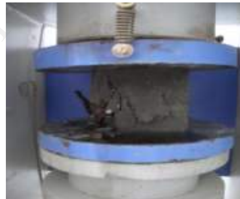
Fig. 1: Test Set up for Compressive Strength Test

Water: Potable water was used for mixing and curing.