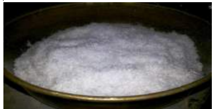
Fig. 1 Sample of waste polythene used.

Waste Polythene: The waste polythene used in this study is shown in fig. 1. It was shredded in very fine random fibre form. The specific gravity for polythene waste is 0.41 and aspect ratio lies between 250 and 500. However, similar material properties were reported by Ankit et al.[3]