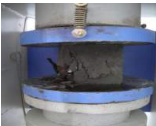
Fig. 3 Set up for compressive strength test in compression testing machine.