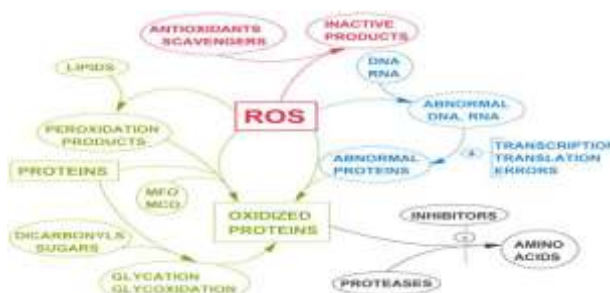
SOURCES OF REACTIVE FREE RADICALS

Reactive oxygen species (ROS) are very small molecules and are highly reactive due to the presence of unpaired valence shell electrons. ROS is formed as a natural byproduct of the normal metabolism of oxygen and have important roles in cell signaling. Generally, harmful effects of reactive oxygen species on the cell are most often like - Damage of DNA, oxidations of polydesaturated fatty acids in lipids, oxidations of amino acids in proteins, oxidatively inactivates specific enzymes by oxidation of co-factors. The effect of ROS can be simply explained by the following fig.no:2.