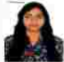
View Data Sheet