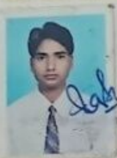
Secretary & Rural Allahabad