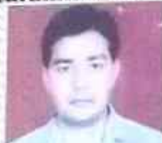
Registrar Uttarakhand Pharmacy Council Dehradun, Uttarakhand

has been duly registered as a Registered Pharmacist, u/s 32(2) of the Pharmacy Act 1948 and is entitled to all the privileges granted under the Pharmacy Act 1948 (8 of 1948). In witness whereof are herewith affixed the seal of the Uttarakhand State Pharmacy Council and the signature of the Registrar.