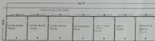
EXIST GROUND FLOOR PLAN