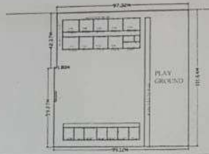
SITE PLAN 1:400