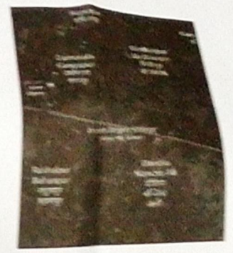
GOOGLE LOCATION PLAN (SCALE=N.T.S.)