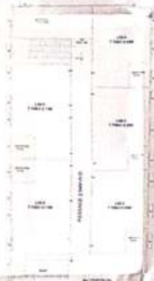
SECOND FLOOR PLAN SCALE=1:100