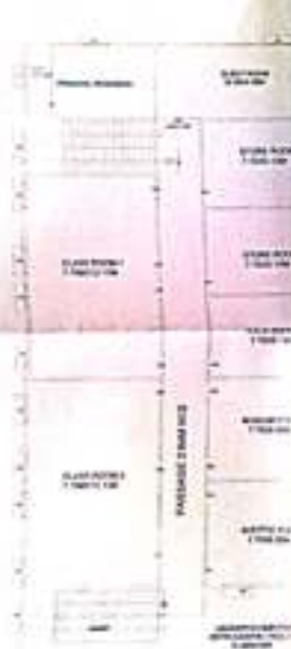
FIRST FLOOR PLAN SCALE=1:100