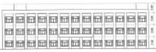
FRONT ELEVATION (1:200)