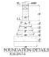
FOUNDATION DETAILS REINFORCE