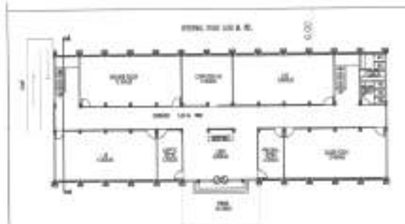
GROUND FLOOR PLAN (1:200) AREA OF GROUND FLOOR = 754.46 SQ.M.