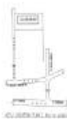
SITE PLAN (1:500)