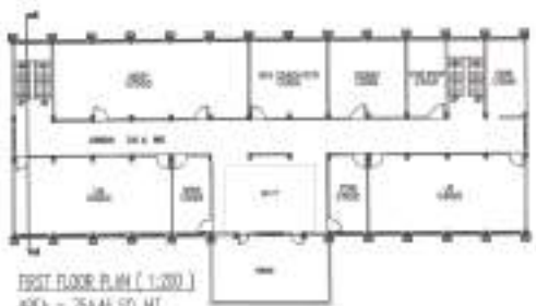
FIRST FLOOR PLAN (1:200) AREA = 754.46 SQ.M.