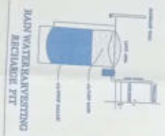
RAIN WATER HARVESTING RECIPIABLE PIT