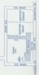
SITE / KEY PLAN