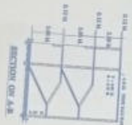
SECTION OF G.F.