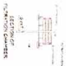
SECTION OF FILTRATION CHAMBER