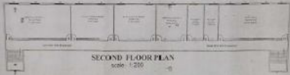
SECOND FLOOR PLAN scale - 1:200