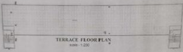
TERRACE FLOOR PLAN scale - 1:200