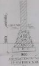
FOUNDATION WALL CROSS SECTION