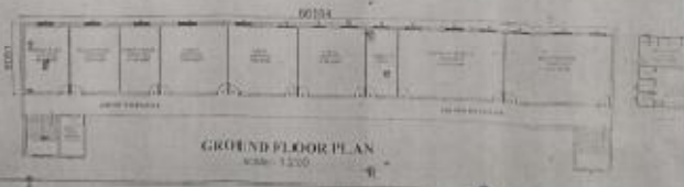
GROUND FLOOR PLAN scale - 1:200