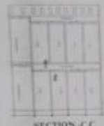
SECTION - C-C SCALE - 1/100

EXISTING BUILDING OF K.K.T. COLLEGE OF PHARMACY, WEL & POST, BAGAPAR, DISTT - MAHARAJGARH (UP), GATA NO - 4999M.