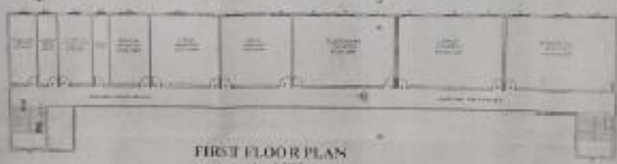
FIRST FLOOR PLAN scale - 1:200