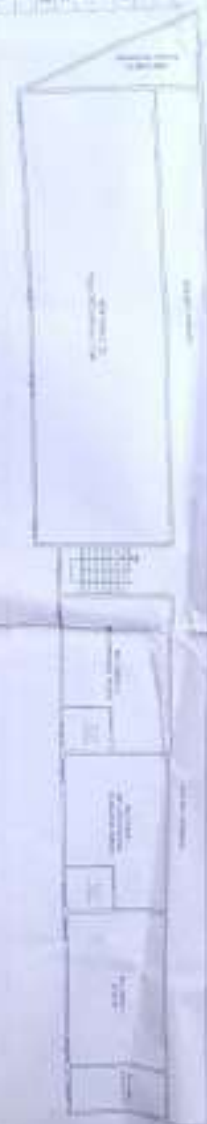
SECOND FLOOR PLAN SCALE=1:100