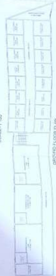
GROUND FLOOR PLAN SCALE=1:100

RAJSHI KHANSAHAB, BANGALORE ROAD, DHA-11, DISTRICT-11, GAZIPORE, DHAKA-1207, BANGLADESH. TEL: 02-9881111, 02-9881112, 02-9881113 WWW.DHAKAUNIVERSITYEDUCATION.COM