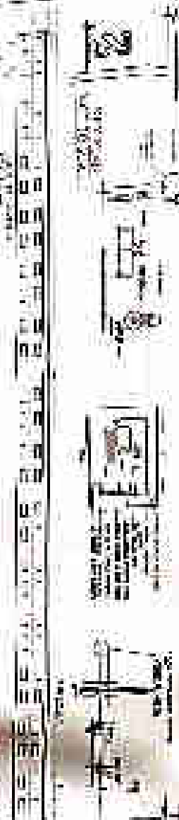
THIRD FLOOR SCALE 1/8"