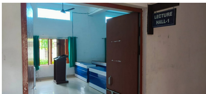
Class room 1