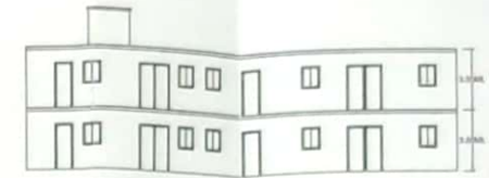
ELEVATION PLAN 2