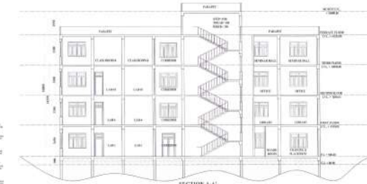
SECTION A-A SCALE (1:100)