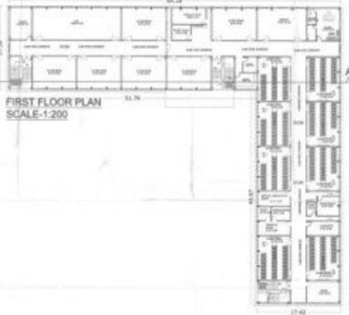
FIRST FLOOR PLAN SCALE-1:200