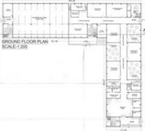
GROUND FLOOR PLAN SCALE-1:200