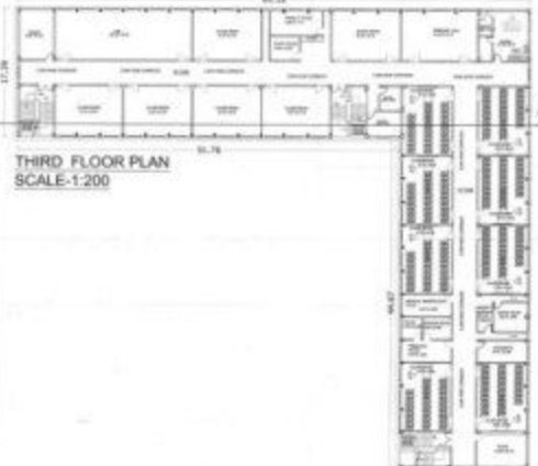
THIRD FLOOR PLAN SCALE-1:200