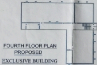
FOURTH FLOOR PLAN PROPOSED EXCLUSIVE BUILDING