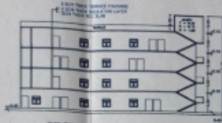
SECTION AT - XX