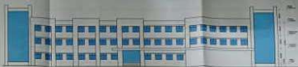
FRONT ELEVATION - Scale 1:250