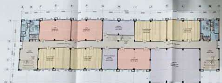
SECOND FLOOR PLAN - Scale 1:200