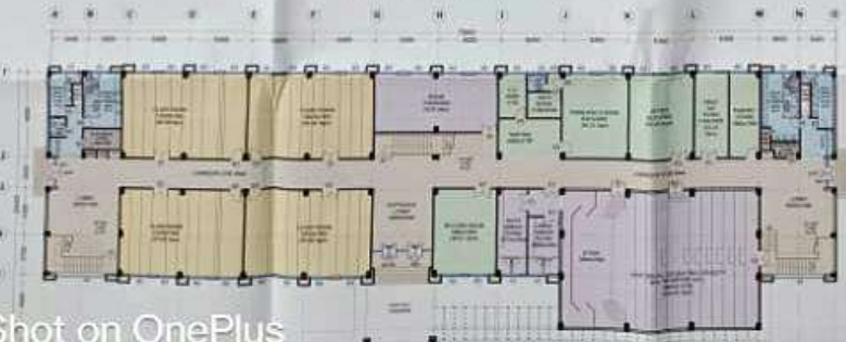
GROUND FLOOR PLAN - Scale 1:200