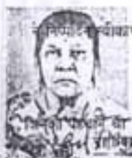
निम्नलिखित बयान किया।