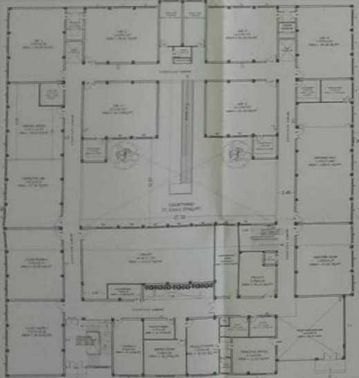
GROUND FLOOR PLAN SCALE: 1:200