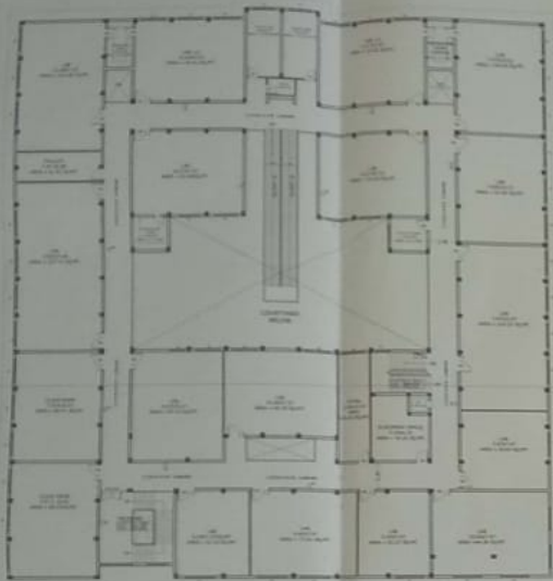
SECOND FLOOR PLAN SCALE: 1:200