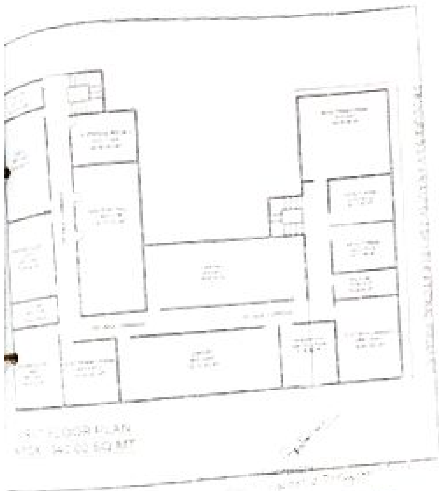
FLOOR PLAN AREA: 14,200 SQ. FT.