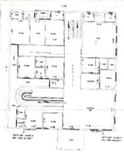
GROUND PLAN BLOCK B