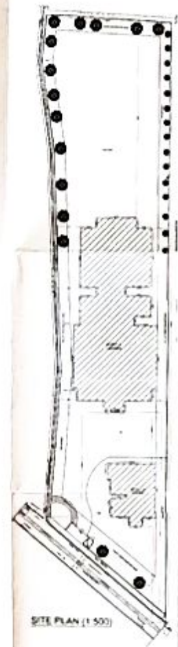
SITE PLAN (1:500)