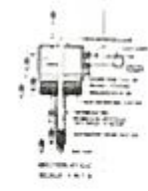
CONCRETE SLAB WITH REINFORCEMENT