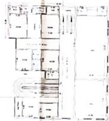
FIRST & SECOND PLAN BLOCK B