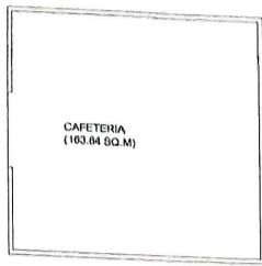
GROUND FLOOR PLAN (CAFETERIA) SCALE:1:100