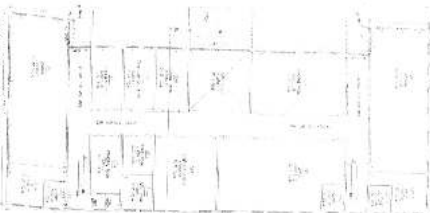
GROUND FLOOR PLAN SCALE: 1:200