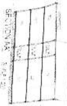
SECTION AA SCALE: 1:20