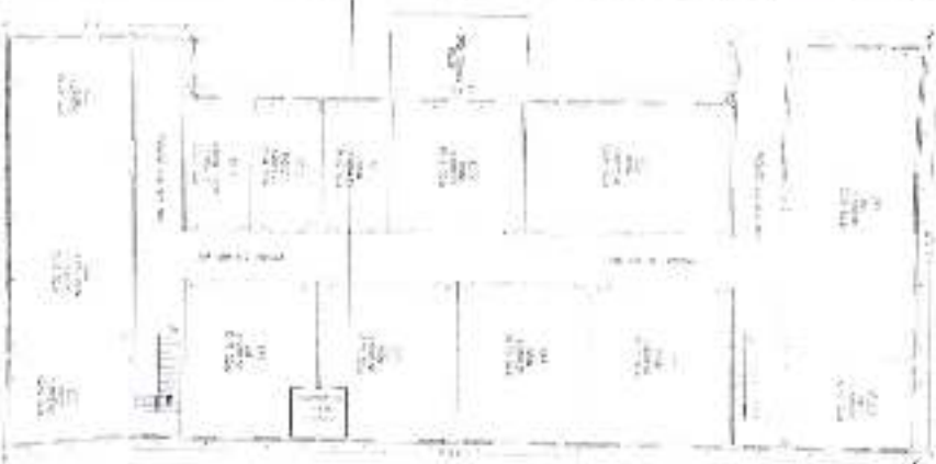
SECOND FLOOR PLAN SCALE: 1:200