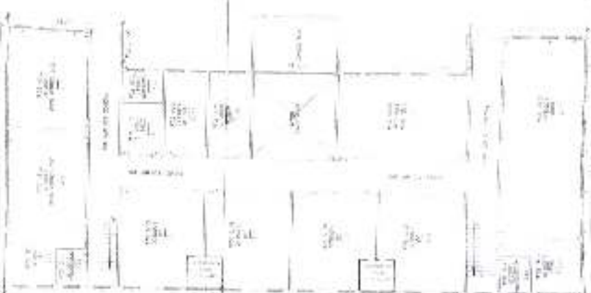
FIRST FLOOR PLAN SCALE: 1:200